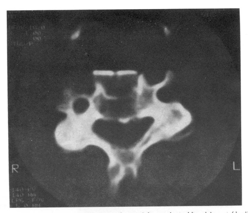
Fig.3 : Postoperative (10 days) C.A.T. without contrast showing C4-5 after removal of a massive herniated disc and placement of dowel bone graft.

radiculopathy. was obtained in 214 patients. Among them was a group with numbness of the fingers, "clumsy hands", as described by Good (17) and England (10) in whom pain played little or no part in their complaints. Neurological findings were restricted to C3-4 and C4-5 nerve roots. There were 14 patients in this group of upper cervical radiculopathy, three of whom had bilateral symptoms. All fourteen patients benefited from anterior cervical disc removal, whether on one side or bilaterally, performed through a 17 mm opening.