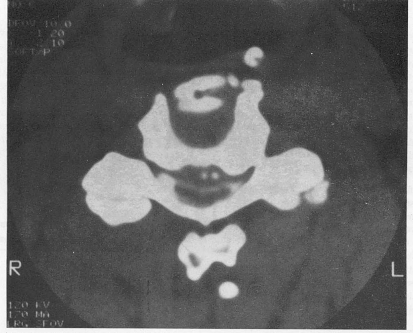
Fig.2 : Cervical spine C.A.T. scan. Transverse section of C4-5 after metrizamide myelogram showing a central disc herniation and calcification compressing the spinal cord which measures 5-6 mm.