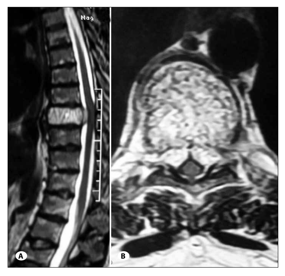
Figure 2: A) Magnetic resonance imaging of thoracic spine (sagittal view) with contrast showing T8 hemangioma compressing the anterior spinal cord. B) Magnetic resonance imaging of thoracic spine (axial view) showing T8 hemangioma encasing the spinal cord.

Vertebral hemangiomas are benign vascular lesions of the bone and can be cavernous, capillary, or mixed. Only a small percentage of vertebral hemangiomas progress to cord compression. No standard therapy exists for symptomatic vertebral hemangiomas. However, immediate surgical intervention before the symptoms become irreversible is necessary in cases with acute compressive myelopathy. Several surgical options are currently available for the management of symptomatic vertebral hemangiomas. They include surgical decompression, short segment posterior stabilization and