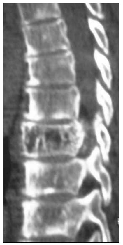
Figure 1: Computed tomography of thoracic spine showing T8 vertebral hemangioma.

examination was unremarkable. The neurology examination revealed bilateral hypoesthesia below the T8 level, and hyperactive deep tendon reflexes in her left leg. Computed tomography of the thoracic spine showed a T8 vertebral hemangioma (Figure 1). T1-weighted magnetic resonance imaging revealed a T8 hemangioma compressing the spinal cord (Figure 2A,B). Spinal angiography was performed to evaluate the blood supply of the hemangioma and showed that it was supplied by the anterior spinal artery (Figure 3). Surgical intervention was planned and T8 total laminectomy was performed. The tumor extending into the anterior spinal cord was resected, and T8 vertebroplasty with short segment posterior stabilization and fusion was performed (Figure 4A,B). The patient was discharged on the 5th postoperative day and had no neurological deficit.