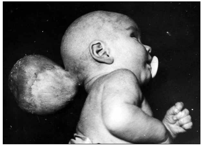
Figure 5: A patient with occipital encephalocele.