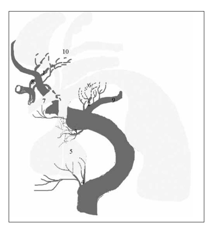
Figure 1: Schematic of blood supply for the hypothalamic region. 1. Perforating branches of the anterior communicating artery; 2. Perforating branches of the posterior communicating artery; 3. Upper hypophyseal artery; 4. Inferior hypophyseal artery; 5. The posterior lobe of pituitary; 6. Mammillary bodies; 7. Chiasm; 8. A anterior communicating artery; 9. Posterior communicating artery; 10. The anterior wall of the third ventricle.

The outside group comprised the perforating arteries that originated from the outside of the third ventricles, pituitary stalk and two blood supply regions (1). The blood supply of the third ventricle was mainly from the perforating arteries that originated from the lower part of the PCoA. Up to 17 of the 20 head specimens had a PCoA from the ICA, and three specimens had hypoplastic PCoA in one side and a naive PCoA in the other side. PCoA formed the external Circle of