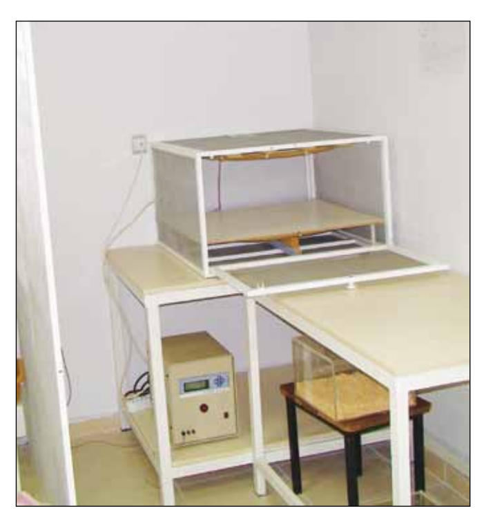
Figure 1: View of magnetic field system used in the study.

In this experimental study, 4 different brands of programmable CSF shunts were exposed to the magnetic field generated by our apparatus described above coil for 5 minutes (Figure 3). Groups 1-4 were composed of Miethke® (B. Braun Melsungen AG, Melsungen, Germany), Medtronic Strata® (Medtronic, Minessota, USA), Sophysa Sophy® (Sophysa, Orsay, France), and Codman® Hakim® (Codman Neuro, MA, USA) brands, respectively. In every CSF shunt, initial pressures were adjusted to 110 mm H<sub>2</sub>O and pressures after an exposure to magnetic field for 5 minutes were noted. These measurements were implemented at frequencies of 5 Hz, 20 Hz, 30 Hz, 40 Hz,