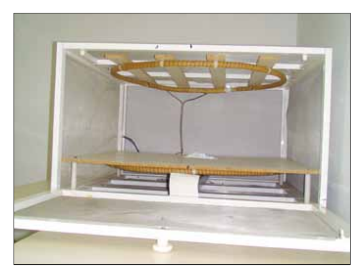
Figure 3: Four different brands of programmable CSF shunts were exposed to the magnetic field generated by our apparatus described above coil for 5 minutes.

60 Hz and 80 Hz. In each group, 3 shunts were utilized and evaluations were made twice for every shunt (Figure 4A-D).