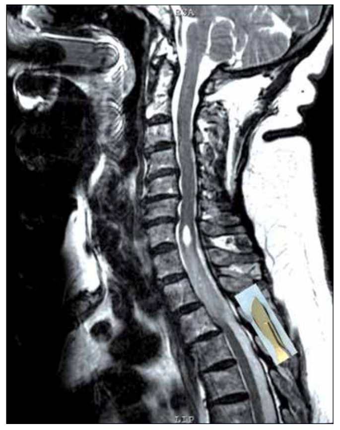
Figure 1: Sagittal T2-weighted MRI imaging of the thoracic spine at the T3 vertebral body level revealed the scalpel sign, a radiological entity diagnostic of a dorsal thoracic arachnoid web. Increased cord signal and syringomyelia are present above the level of indentation.