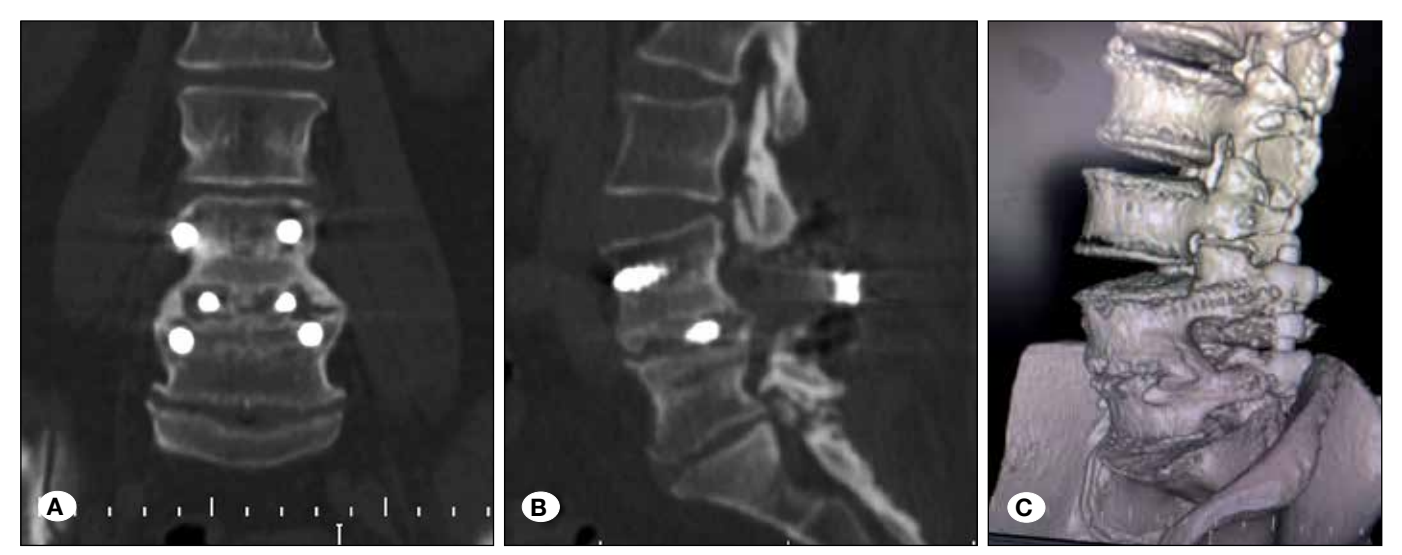
Figure 2: The coronal (A), sagittal (B), and 3D (C) CT reconstructions showing bilateral pedicle screw fixation and solid bony fusion.