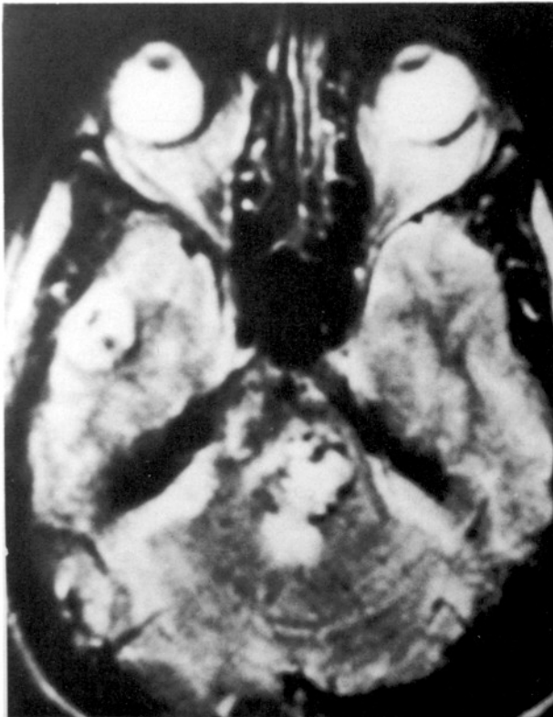
Fig. 2 : Axial magnetic resonance scan in 1990; there are multiple lesions with decreased signal intensity compatible with calcifications and lesions in the brainstem and left temporal region are well circumscribed with a core of mixed signal intensity on T2-weighted image.

The clinical manifestations of cavernous angiomas include seizures, intraparenchymal bleeding and progressive neurological deficits (1,5). Symptoms and signs tend to be progressive due to recurrent haemorrhages (8). Cosgrove et al pointed out that stepwise deterioration is characteristic for cavernous angioma (2). In this patient, the first symptom, diplopia, might be due to the brain stem lesion which appeared 50 years ago; in subsequent years, complex partial seizures had started and were controlled by adequate medication. In recent years, gait and speech disturbances, bladder dysfunction and mental deterioration were added. We observed bilateral ophthalmoplegia, corticospinal tract signs, cerebellar and bladder dysfunctions.