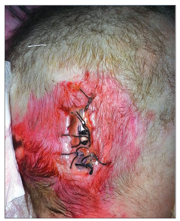
Figure 1: VP shunt wound dehiscence and exposed shunt.

ends of the horizontal line are joined to form the upper part of a circle. Lastly, a 3-4 cm line, which is parallel to the distal catheter, is drawn from the left hand side of the horizontal line so that an incision line is formed in an "inverse J" shape. This pattern should constitute a mirror image, depending on the operation site being on the left- or right hand side of cranium (Figure 2). First, the skin flap is opened by tracking the "inverse J" shape. Then, the abdominal cavity is opened, and the distal catheter is sent through the tunnel from abdomen