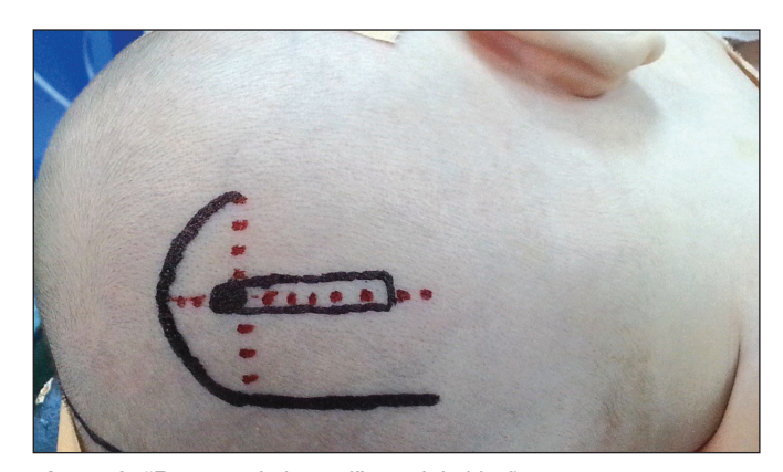
Figure 2: "Reverse J shaped" cranial skin flap.

The periosteal flap is opened in a suitable manner for the skin flap. A small incision is made in the periosteum and the distal catheter is placed underneath the periosteum (Figure 4). A burr hole is opened from the projection of the ventricular catheter's entry point on the bone, which is marked on the skin. Depending on the shape, width, and length of the shunt hardware, a suitable bone groove is tailored by using a bone rongeur or a high-speed drill in the calvarium in the direction of the valve and/or reservoir system (Figure 5). Holes for suturing are opened to both edges of the sulcus with a high-speed drill. After placement and interconnection of the ventricular catheter with the valve, the catheter is drawn from its abdominal side to insert the hardware into the opened hole. The hardware is secured with sutures from two sites, each of which are passed through the hole in the bone and stabilized (Figure 6). With this sulcus opened by high-speed