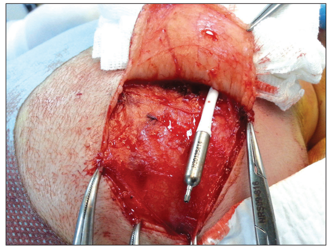
Figure 3: Placement of the distal catheter over the periosteum.

to the cranial flap and passed beneath the flap and on the periosteum (Figure 3).