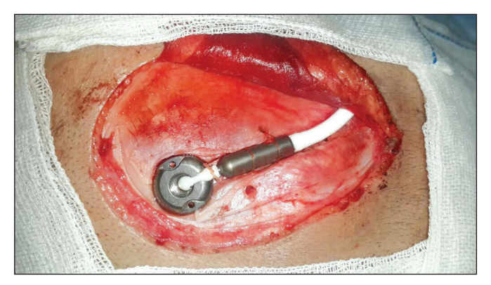
Figure 6: Placement of the shunt hardware into the bone groove and securing it to bone from both sides.

infections after shunt applications with different models, both by us and others. Moreover, shunt hardware becoming visible from outside is a cosmetic problem in patients without wound problems. Hence, to prevent these serious medical and cosmetic problems, we have begun to apply a different surgical technique for 5 years.