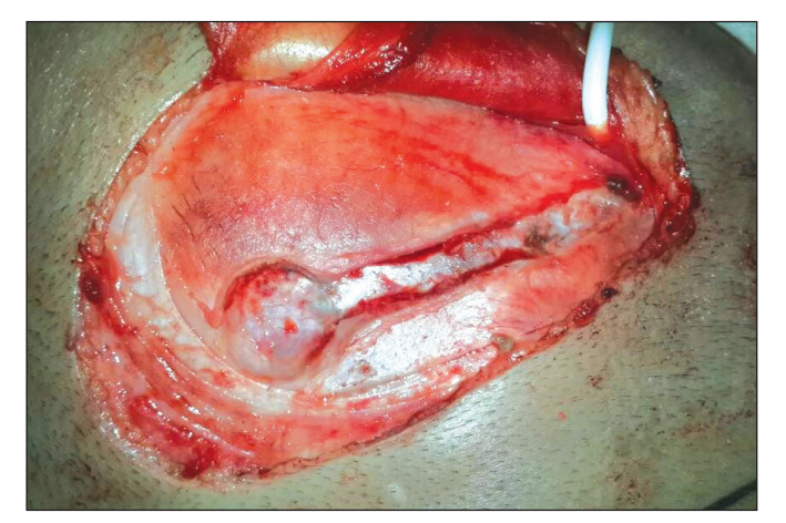
Figure 5: "Bone Groove" opened for the shunt hardware.