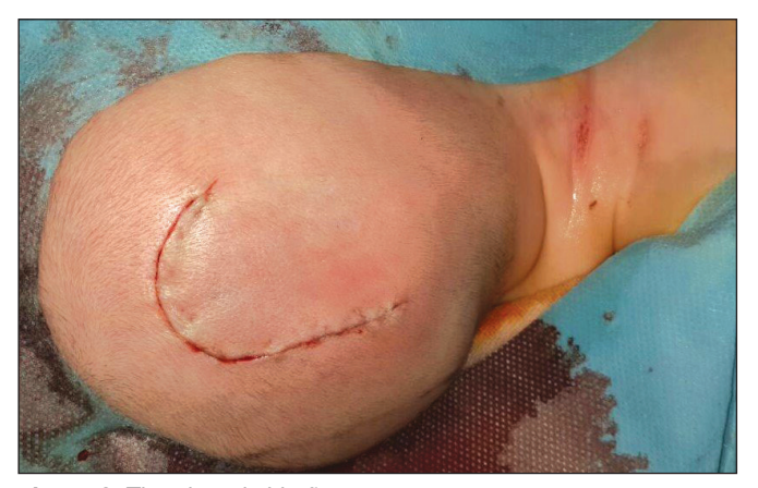
Figure 8: The closed skin flap.