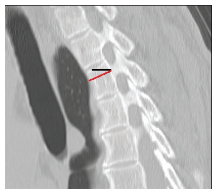
Figure 3: Red line depicting the direction of pedicle and the black line depicting the direction of computed tomography (CT) section.

There are significant variations based on the physical characteristics of the population where the study was conducted in terms of the morphological characteristics of their pedicle. Compared with other populations, the Turkish population has a smaller pedicle width on sagittal and transverse planes, and their PL and medial angling is similar to those of other populations. Male patients who are taller and overweight have higher pedicle width and length. Because the assessment made using CT measurements provided smaller values compared with the ones conducted on cadavers, it is a secure method for preoperative planning. The midthoracic region in particular should be assessed based on CT scans preoperatively and salvage procedures should be considered.