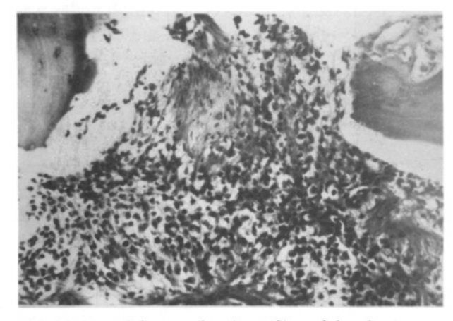
Fig. 2 : Cranial bone trabeculae infiltrated by the tumour (Hematoxylin-eosin X 200).

extension (Fig. 2) The patient was discharged on the 9th post-operative day in good health.