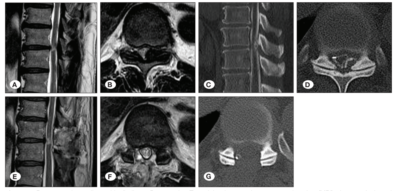
Figure 1: Representative radiographic findings. Preoperative T2-weighted magnetic resonance imaging (MRI) shows spinal cord compression and intramedullary signal change ( A and B ). Preoperative computed tomography (CT) myelography shows ossified ligamentum flavum ( C and D ). Postoperative MRI shows the decompression and absence of epidural hematoma ( E and F ). Postoperative CT shows the resection of the ossified lesion and limited destruction of the facet ( G ).

Surgical outcomes were assessed using a modified Japanese Orthopaedic Association (mJOA) scoring system and the