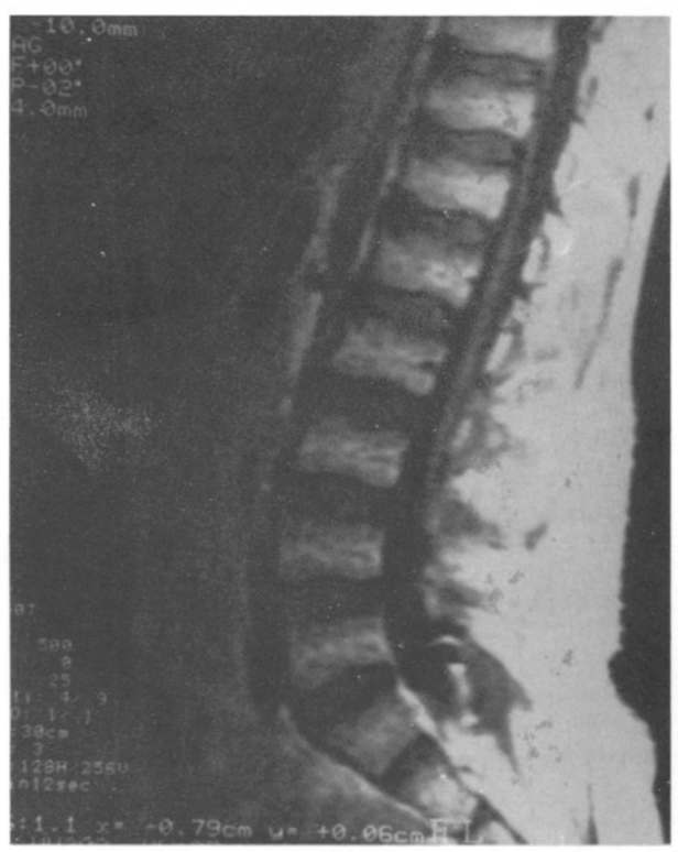
Fig. 3: Postoperative T1-weighted MRI in the sagittal plane demonstrating that the intrasacral cyst has disappeared and the conus medullaris is elevated.

Type I : Extradural meningoceles without spinal nerve root fibers