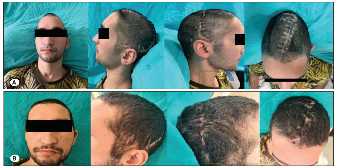
Figure 3: A) Before surgery; photographs of the patient showing the cranium defects were taken from all angles. B) After surgery; photographs of the patient showing the cranium defects were taken from all angles. (The patient consented to the publication of his image.)