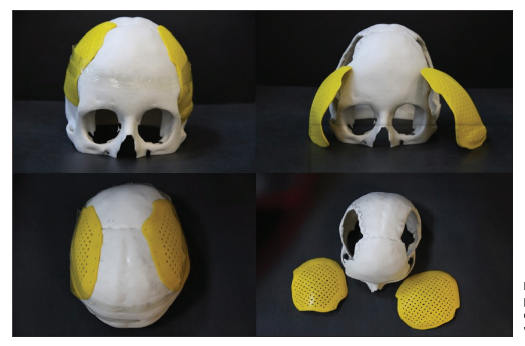
Figure 2: Plastic models were produced according to the threedimensional (3D) images in the virtual environment.

(Figure 2). A preoperative skin evaluation of the patient was performed (Figure 3). After the antiseptic procedures, the patient was given a position that would provide access to the defect area on both sides or access to the area on the side of the large defect. The previous skin incisions were used to reach the defect area. The incision was enlarged when necessary. When the titanium implant was fully inserted into the defect area, the dura was suspended with 5.0 silk sutures