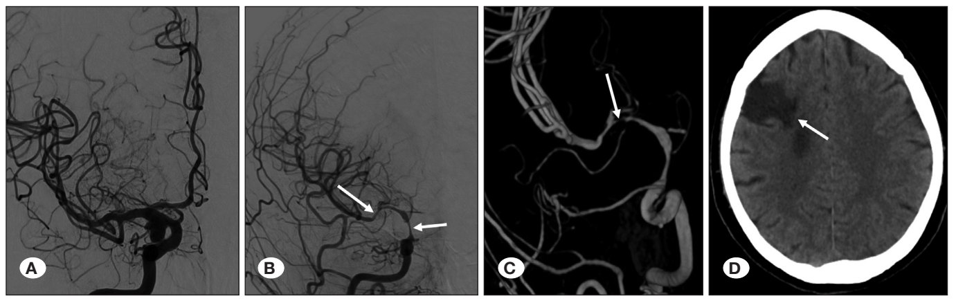
Figure 2: A) Posterolateral projecting right bilobule posterior communicating artery aneurysm (white arrow). B) Severe in-stent stenosis (white arrows). C) Severe stenosis demonstrated on a three-dimensionally reconstracted image (white arrow). D) Middle cerebral artery superior trunk territory enfarction on a computed tomography scan (white arrow).