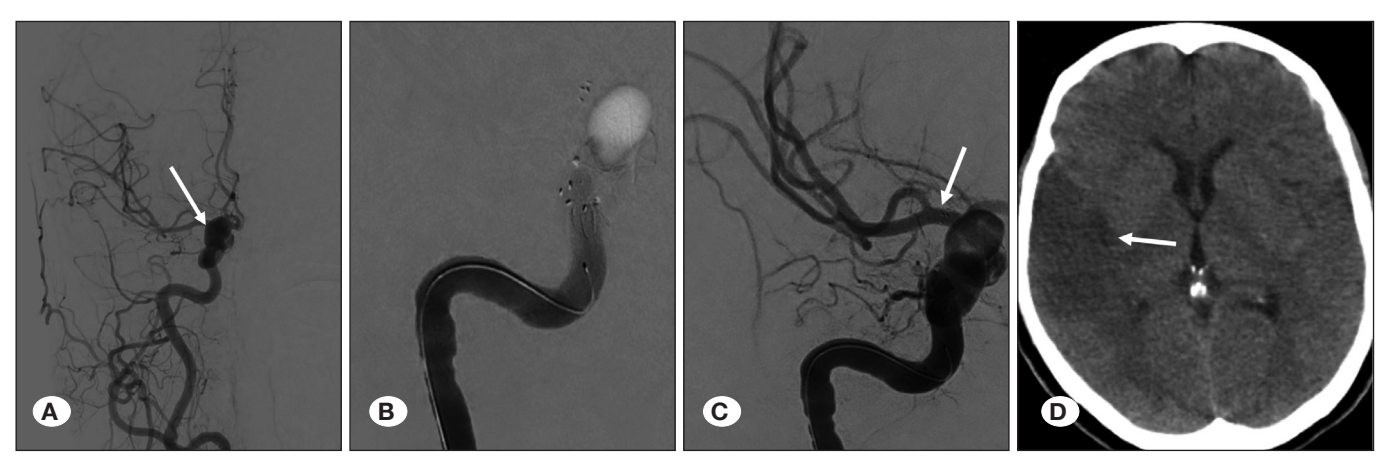
Figure 1: A) Bilobule wide-necked right posterior communicating artery aneurysm (white arrow). B) Current flow stagnation proximal to the stent and placement of a mechanical thrombectomy catheter. C) Definitive revascularization after mechanical thrombectomy and intra-arterial thrombolitic therapy (white arrow). D) Middle cerebral artery inferior trunk territory enfarction on a computed tomography scan (white arrow).