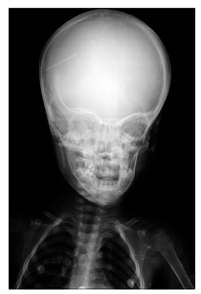
Figure 1: A fracture of the peritoneal catheter at the cervical level is seen with direct x-ray.

that had migrated to the abdominal cavity was removed laparoscopically with a single incision in the right upper quadrant of the abdomen. It was observed that the ventricular end and the valve were working properly. A revision was performed with a new peritoneal catheter. The distal end of the peritoneal catheter was placed into the peritoneal cavity through the laparoscopy incision. No growth was observed in CSF, blood and urine cultures. The patient received no antibiotics other than the prophylactic ones (ceftriaxone 75 mg/kg single dose pre-operatively and twice dose post-operatively). Neurological problems and the increased white blood cell count returned to normal after the operation.