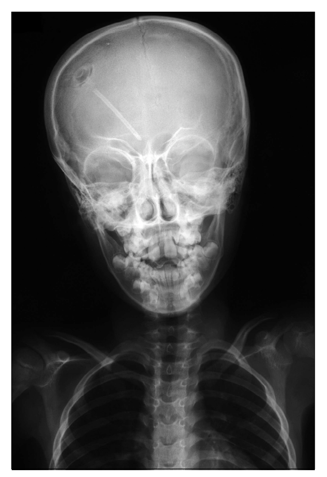
Figure 3: Ventricular and peritoneal ends are disconnected from the valve in direct x-ray.

end, which was completely independent from the valve, was removed during the operation. A fibrotic tract towards brain tissue was observed, through which the ventricular catheter in the intracranial segment of the Burr hole type valve passed. The fibrotic tract was freed from brain tissue and excised. Through the laparoscopy incision, an attempt was made to remove the peritoneal catheter that had migrated to the abdominal cavity, but the attempt was unsuccessful. At laparotomy it was seen that the catheter was attached to liver by adhesions (Figure 5). The peritoneal catheter was freed from the liver and removed. In the pre-operative tomography, since there was no significant hydrocephalus despite the non-functional shunt, establishing a new shunt did not prove necessary. Despite antiepileptic treatment (phenytoin, carbamazepine) preoperatively, the seizure frequency of the patient, experiencing hourly episodes on average, decreased significantly, and on his follow-up after two months,