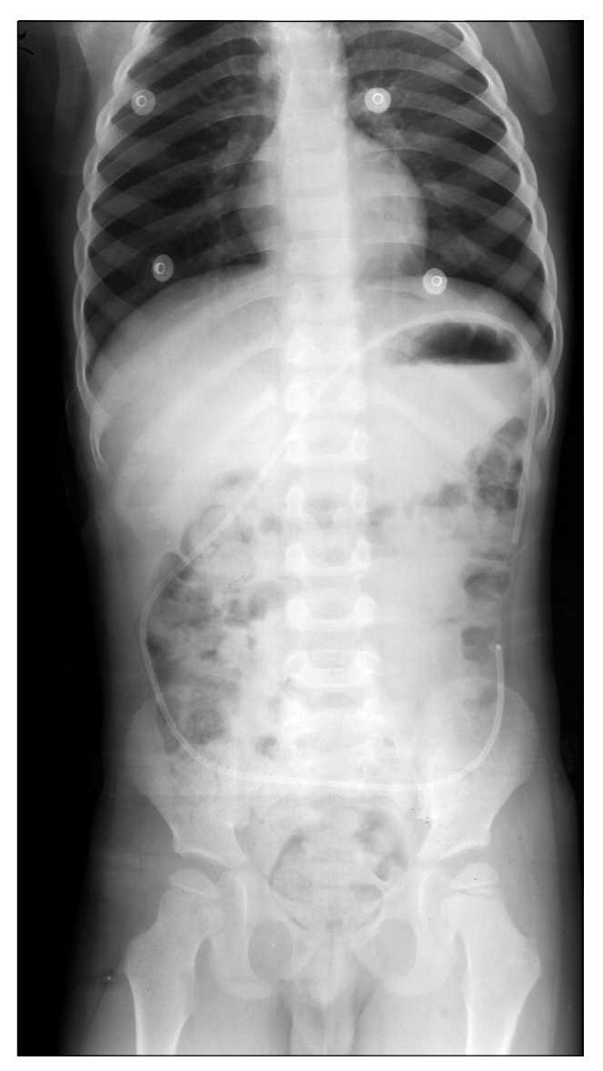
Figure 2: There is migration of the distal peritoneal end to the abdominal cavity.

A seven-year-old boy had fever, abdominal pain and an increased number of epileptic episodes on admission. History revealed left hemiparesis due to