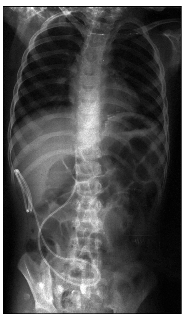
Figure 4: The peritoneal catheter has migrated to the abdominal cavity.

end, which was completely independent from the valve, was removed during the operation. A fibrotic tract towards brain tissue was observed, through which the ventricular catheter in the intracranial segment of the Burr hole type valve passed. The fibrotic tract was freed from brain tissue and excised. Through the laparoscopy incision, an attempt was made to remove the peritoneal catheter that had migrated to the abdominal cavity, but the attempt was unsuccessful. At laparotomy it was seen that the catheter was attached to liver by adhesions (Figure 5). The peritoneal catheter was freed from the liver and removed. In the pre-operative tomography, since there was no significant hydrocephalus despite the non-functional shunt, establishing a new shunt did not prove necessary. Despite antiepileptic treatment (phenytoin, carbamazepine) preoperatively, the seizure frequency of the patient, experiencing hourly episodes on average, decreased significantly, and on his follow-up after two months,