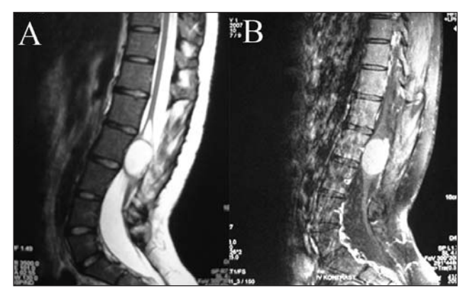
Figure 1: Sagittal T2-weighted MRI of the lumbar spine shows (A) a large cystic lesion at L2 filling almost all of the entire spinal canal. Previously created L1, L2 and L3 laminectomy defects are seen. Low conus medullaris at the level of L3-4 is also seen with tethered cord. (B) In the gadolinium enhanced sagittal T1-weighted image, there is no enhancement of the cyst.

The postoperative course was uneventful and the lower back and left leg pain improved immediately. Muscle strength had returned to normal three months later. The patient continued to do well 8 months later.