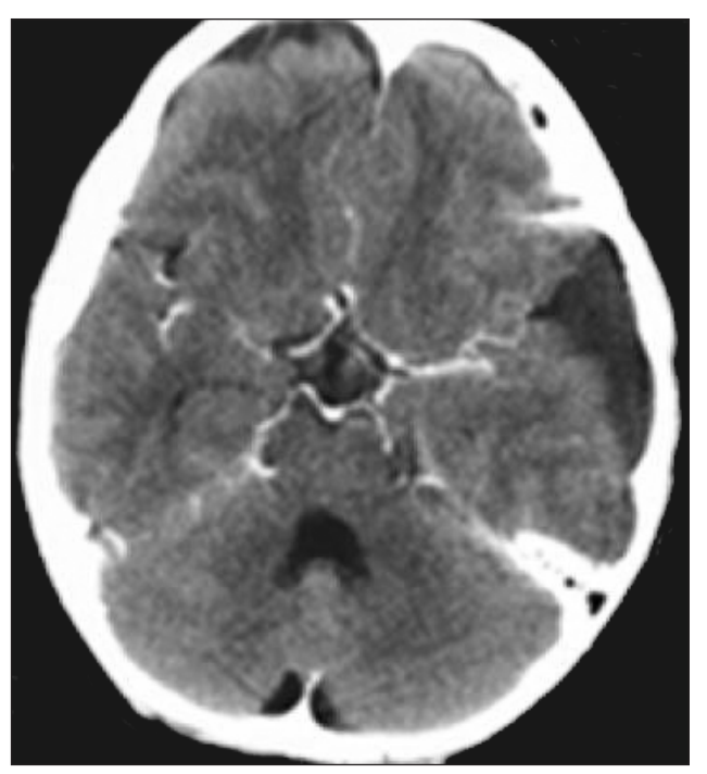
Figure 1B: CT scan revealed an arachnoid cyst located at the left temporal pole distal to Sylvian fissure

Three-fourths of all arachnoid cysts are located supratentorially, while one fourth are infratentorial. The most frequent site is the Sylvian fissure (34.6% - 59.6 %). Cerebral convexity (10.1% - 12.9%), sellar region (6.7% - 11.3%) and interhemispheric fissure (6.5%) are the other frequent locations. Cerebellomedullary cistern is the most frequent