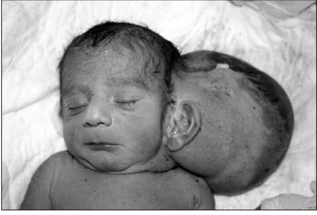
Figure 1: Preoperative presentation.