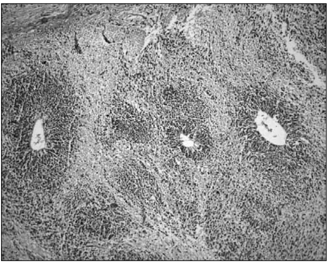
Figure 4: Histopathological image of soft tissue mass.

Even though teratomas are rare tumors, they are the most frequent congenital tumors located in the dorsal midline, and