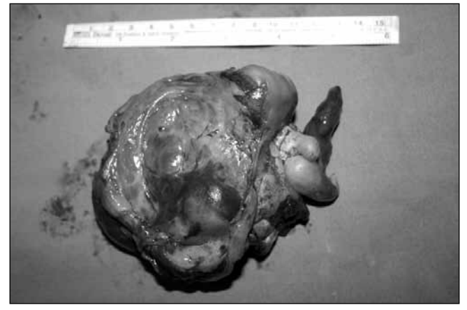
Figure 3: Total occipitotemporal mass extracted.

discharged from the hospital to be followed in the outpatient clinic. The pathologic study of the excised mass was reported as a grade II-III immature teratoma (Figure 4). The patient has been followed for 1 year without a recurrence (Figure 5).