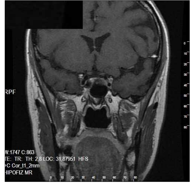
Figure 2: Postoperative T1-weighted MRI scan.

Figure 1: A) Preoperative T1-weighted MRI scan with Gadolinium showing the pituitary mass lesion. B) Preoperative T2-weighted MRI scan showing the pituitary mass lesion.