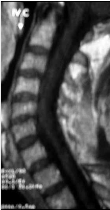
Figure 4: At 6 months post-operative, control MRI revealed there was no evidence of tumor's recurrence.

the local recurrence rate after initial gross total excision was 18% (4). The effectiveness of radiotherapy to prevent recurrence after initial gross total tumor excision is unclear (2). Furlong et al suggested that radiotherapy should be reserved for inoperable cases, thereby avoiding the potential for radiation-induced neurological damage and the smaller risk of post-radiation sarcoma (2). In our case, we were able to remove the tumor totally, and we did not carry out radiotherapy. There was no evidence of recurrence after 6 months (Figure 4).