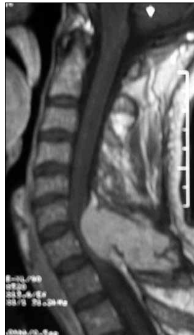
Figure 2: T1-weighted image of contrast-enhanced magnetic resonance imaging (MRI) showed lobulated mass that extended superiorly and inferiorly between C6-Th2 vertebral levels.