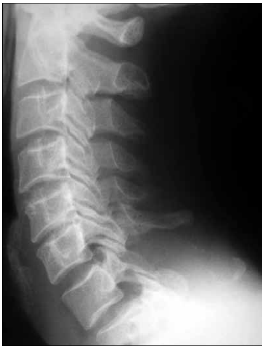
Figure 1: Plain X-rays of cervical spine showed a destructive lesion that affected the lamina and spinous process of C7 vertebra.