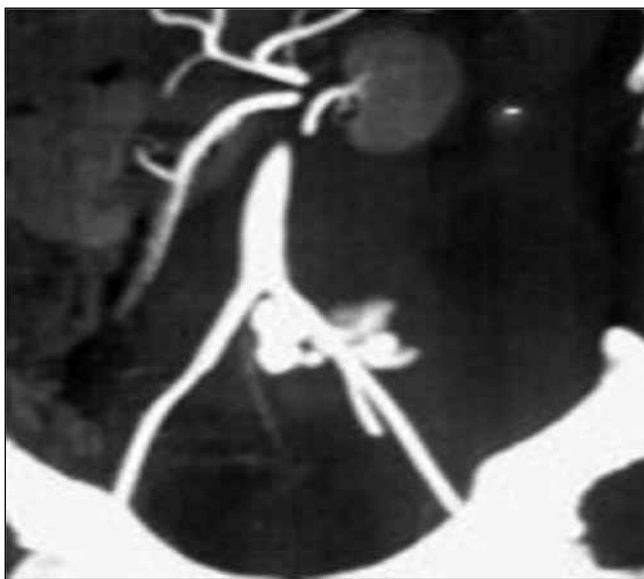
Figure 1: Contrast extravasation from the left common iliac artery.

104/per minute. Ankle brachial index was measured 0.9 at the left lower extremity. Hematocrit level was detected 29% and hemoglobin level was 9 g/dl. Free fluid was seen in the abdominal ultrasound. CT Angiography showed the contrast extravasation from the left common iliac artery (Figure 1). Left common iliac artery and vein injuries were detected in emergency laparotomy. Left iliac vein was ligated and artery was repaired primarily. Sudden respiratory distress was developed on the third day of the operation. Thorax CT angiography, ventilation-perfusion scintigraphy and echocardiography confirmed the pulmonary embolus. Required treatment was held. The patient was discharged without any problem under anticoagulation therapy. He is well at the 5 th year of the operation.