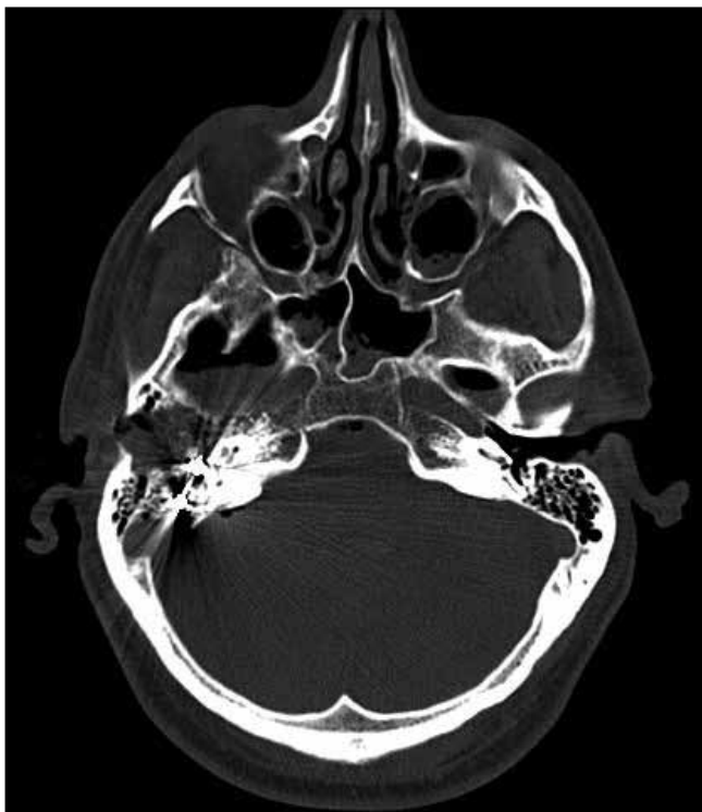
Figure 1: Preoperative CT scan.

As aftereffects of the injury, the patient was having a complete paralysis of the right facial nerve (Grade VI - House Brackmann - No movement, loss of tone, no synkinesis, contracture, or spasm) (4). About eight months after the trauma and neurosurgical operation, the patient underwent a surgical procedure consisting of the reanimation of the right facial nerve through a direct neurorrhaphy with the ipsilateral masseteric nerve. After superficial parotidectomy following a skin incision in the region preauricular pretragus, the operation was preceded to the dissection of the main