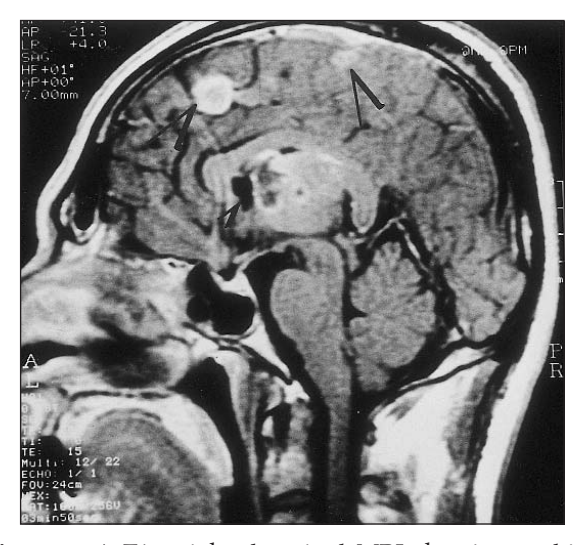
Figure 3. A T1-weighted sagittal MRI showing multiple intracranial enhancing masses after intravenous gadolinium (arrow).

was readmitted a month later for general convulsions and mental status changes. MRI on his second admission showed multiple masses (Figure 3) and he died of pneumonia.