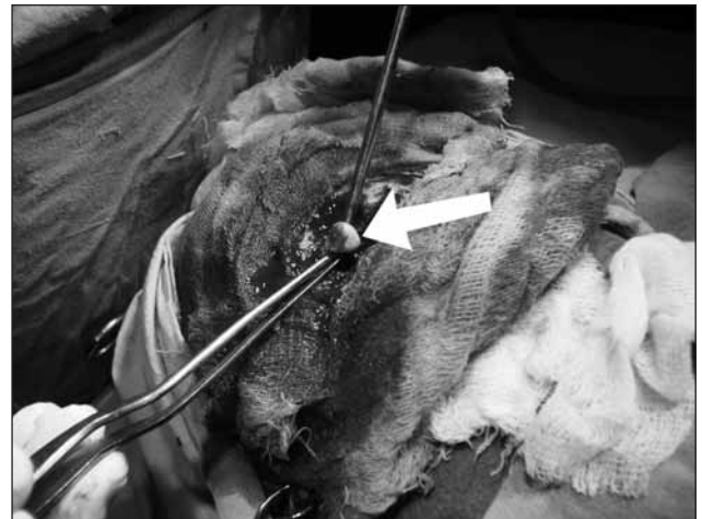
Figure 2: Peroperative photograph showing removal of foreign bodies (Marked with white arrow).

(rotation about the long axis) and fragmentation of the projectile. The velocity of the penetrating object has been emphasized in previous studies and differentiates wounds into "low velocity" and "high velocity". However, velocity is not an independent primary determinant of wounding potential (3).