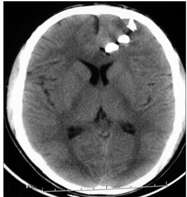
Figure 1: Preoperative CT Head showing three globular hyperdense objects in left frontal region.

Penetrating injuries of the brain are very common in warfare injuries but are rarer in civilian head injuries. Missile injuries account for the majority of penetrating wounds of the brain (5) although the brain has been penetrated by almost every conceivable object. There are reports in literature ranging from a knife (2) to blades, spoons and even nails (8). The major determinant of injury is the behavior of the penetrating object within the tissue which in turn depends on deformation, yaw