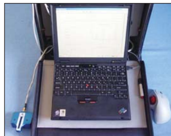
Figure 1: Pressure-Specified Sensory Device.

A total of 55 wrists (bilateral in 7 cases, the right wrist in 41 and the left wrist in 14) underwent carpal tunnel decompression with a mini longitudinal incision technique. The patients were followed-up for 6 to 20 months (mean; 11). The sensory, grip strength, and pinch strength were assessed in operated hands of all patients both before surgery and after the follow-up period. Grip strength - key pinch and sensorial evaluations were performed in all patients by one examiner using the Pressure-Specified Sensory Device [(PSSD), Sensory Management Services, Baltimore, USA] (Figure 1). All patients were seated in a reclining chair and were asked to close their eyes so that they could not see the computer screen or the hand being tested. A button linked to the computer was placed in the hand opposite to the hand being tested, and subjects were instructed to press the button to indicate perception of the test stimulus. The recovery of grip and pinch strength percentages were expressed in mean \pm SD (standard deviation) and p values <0.05 were accepted as statistically significant.