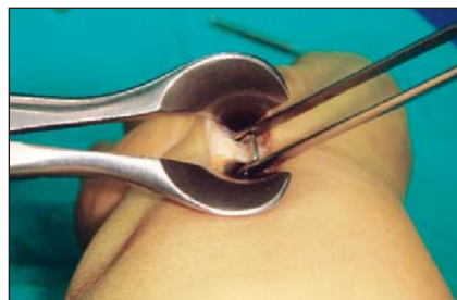
Figure 9: Release of the flexor retinaculum with using the nasal septum knife.