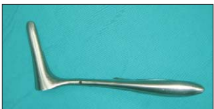
Figure 5: The Killian nasal speculum.