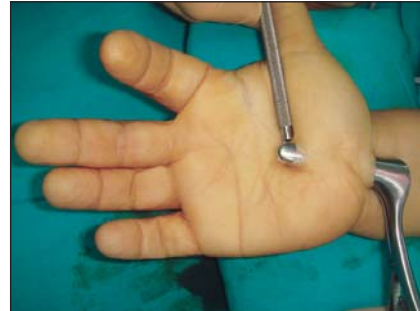
Figure 6: The nasal speculum between the palmar fascia and the transverse carpal ligament.