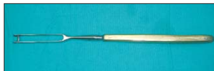
Figure 8: The nasal septum knife.