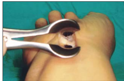
Figure 7: The flexor retinaculum ligament under direct visualization.