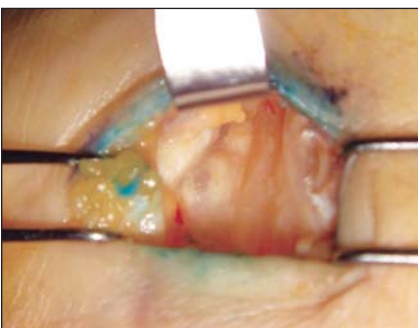
Figure 4: The proximal edge of the flexor retinaculum and median nerve.