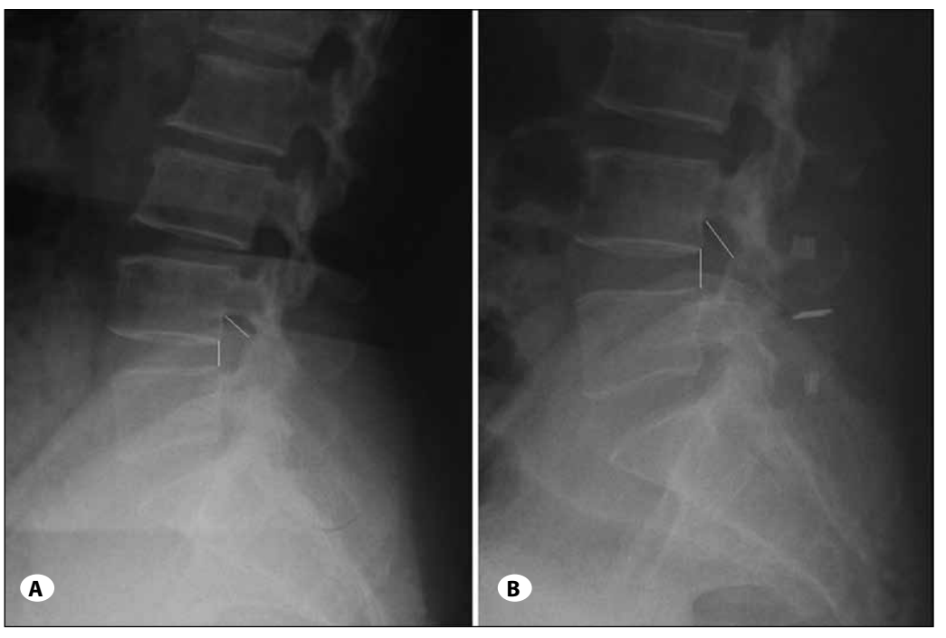
Figure 3: A 52-year-old female patient with lumbar spinal stenosis. A) Preoperative lateral lumbar image; the edge height of the L4,5 intervertebral disc space was 0.70 cm, the neural foramina height was 0.95 cm. B) Postoperative lateral lumbar image; the edge height of the L4,5 intervertebral disc space was 0.97 cm, the neural foramina height was 1.60 cm

significantly after surgery in all 50 patients. Ninety-two percent of patients had good to excellent outcomes based on Odom's criteria. And there was significant improvement during follow-up in the JOA score and ODI score. Our results suggest that the second-generation Wallis device has a positive effect on patients' short- and medium-term clinical outcomes.