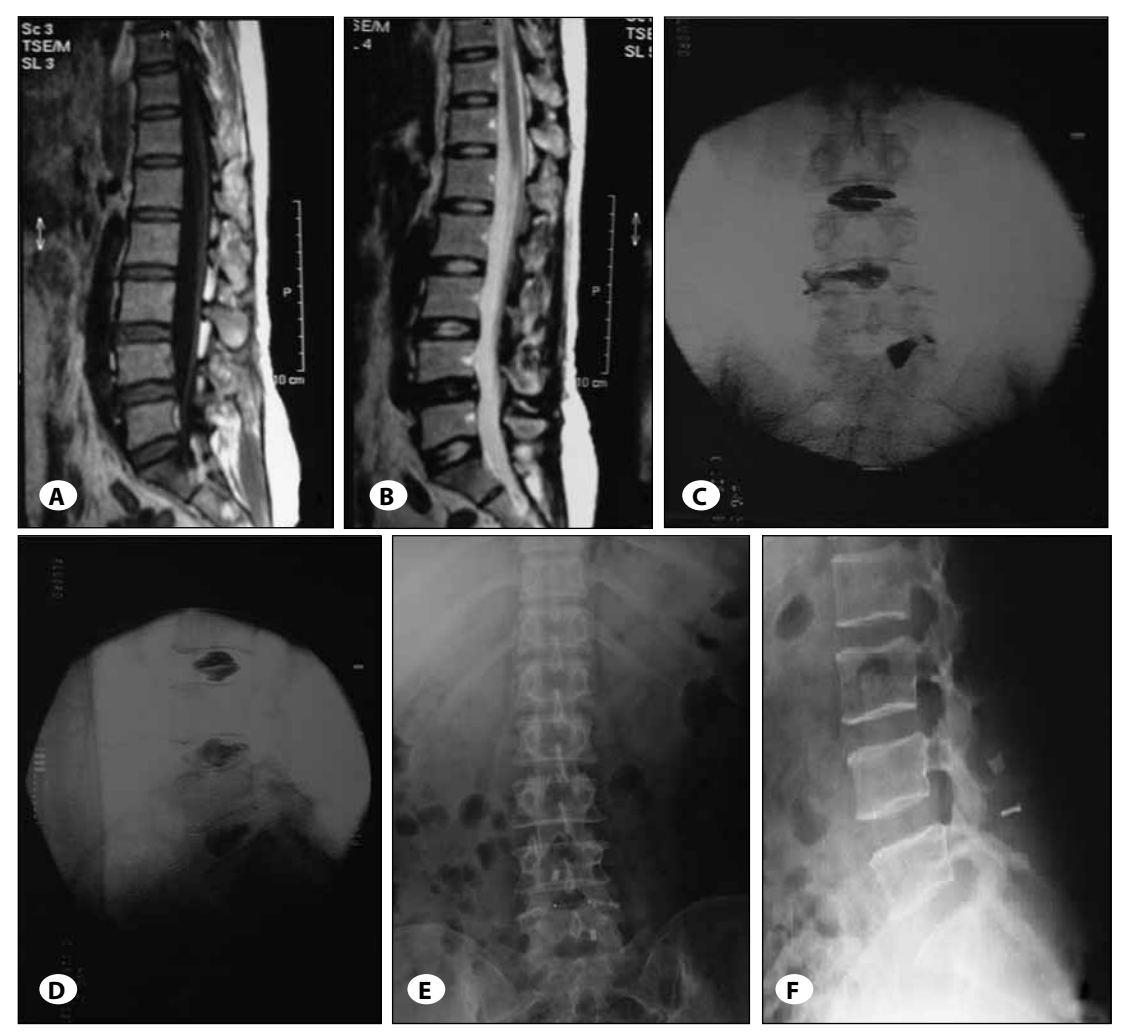
Figure 1: A 48-year-old female patient with discogenic low back pain. A , B ) Preoperative MRI showed intervertebral disk degeneration and high intensity zone on T2-weighted MRI in L4,5. C , D ) The results of lumbar discography showed the internal annular disruption and pain reproduction response in L4,5. E , F ) The lumbar X-ray image after surgery.