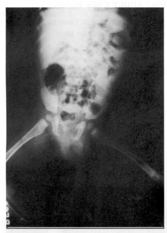
Figure 2: The peritoneal catheter of the shunt was withrawn and shortened

Many reports suggest that haemorrhage can occur in the ventricles, intracerebrally or in the subdural space, even epidural haematoma has been seen (4.6). Avulsion of the choroid plexus, seizure, abdominal complications of the peritoneal tube of a V-P shunt as intestinal or liver capsule perforation, spontaneous extrusion of the peritoneal catheter through an intact abdominal wall are seen extremely rarely (1.2.5.8.9).