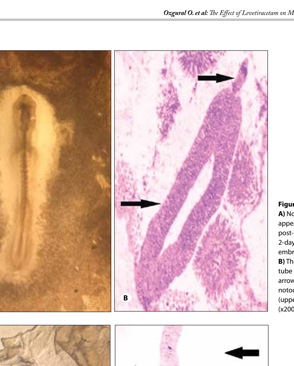
Figure 1: A) Normal appearance of post-incubation 2-day chick embryo. B) The neural tube (lower arrow) and notochord (upper arrow) (x200).

Figure 2: A)Appearance of post-incubation 2-day chick embryo with neural tube defect. B) Defective neural tube (upper arrow) and notochord (lower arrow) (x200).