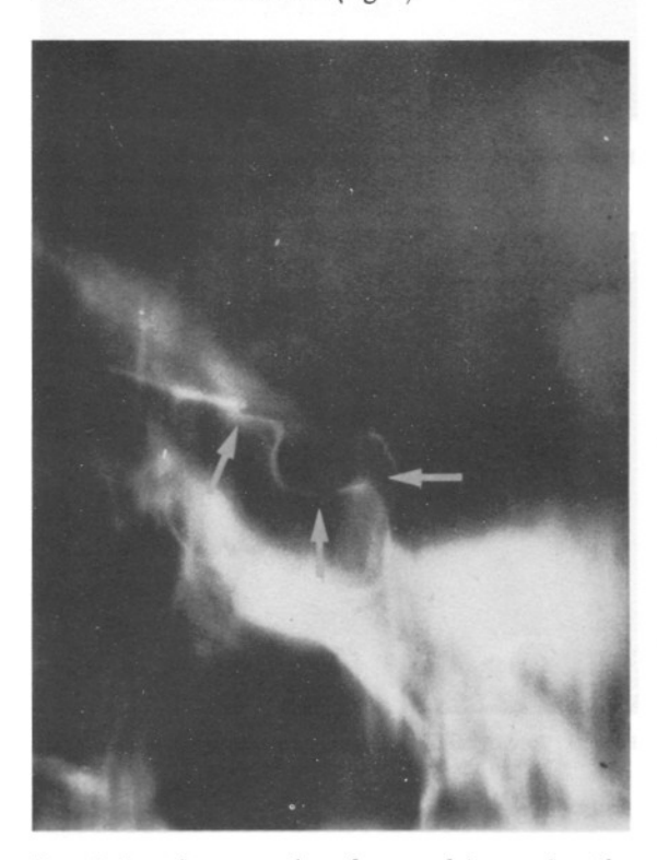
Figure 1: Lateral tomogram shows fractures of planum sphenoidale, base of sella turcica and dorsum sella.

sympis fractures. In addition two lines of fracture starting from the right orbital margin and continuing in the maxilla were noticed (Fig. 2).