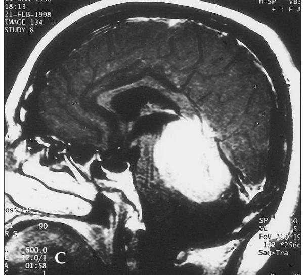
Figure 1A, 1B, 1C: Case 1: A huge solid mass, prominently enhanced, is seen in the pineal region on axial, coronal and sagittal planes in T1-weighted images with gadolinium.

In the first operation, the infratentorial part of the tumor was removed totally through an infratentorial supracerebellar approach. One week after the first operation, a right occipital transtentorial approach was performed in the sitting position and the supratentorial part of the tumor was removed. Histopathological diagnosis verified fibroblastic meningioma. The postoperative course was uneventful, and no neurological deficit was detected. No residual tumor was seen on postoperative MRI, four months after the operation (Figure 1D, 1E, 1F). The last follow-up of the patient (2 years after the operation) showed no neurological deficit.