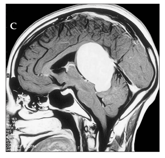
Figure 2A, 2B, 2C: Case 2: Post-gadolinium axial, coronal and sagittal plane T1-weighted images show prominent enhancement in the pineal region.