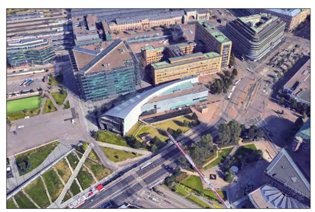
Figure 1: Aerial view of Kiasma Museum Helsinki.