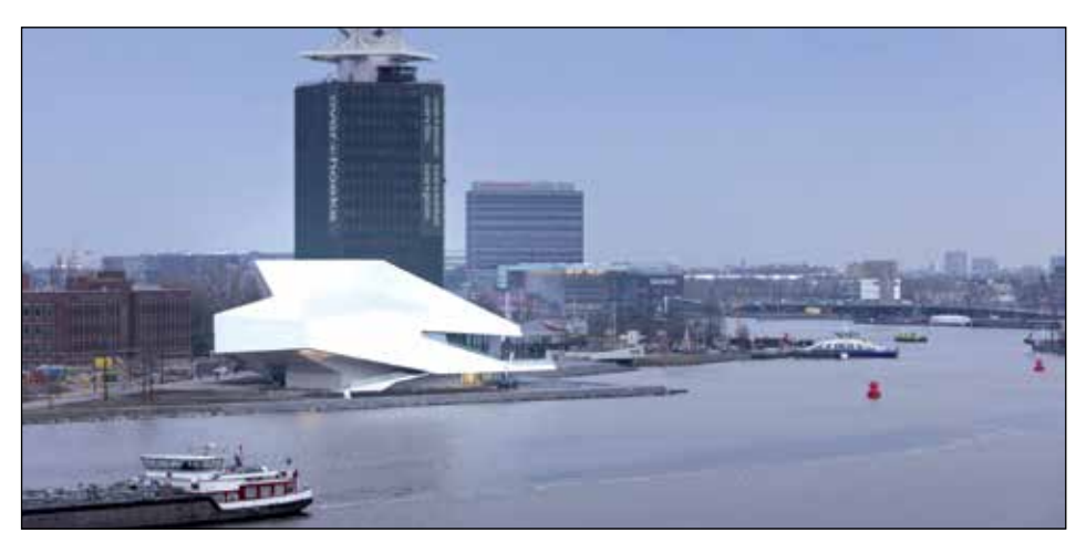
Figure 5: Eye Museum Amsterdam picture from a lateral view resembling an open eye figure with upper and lower lids.