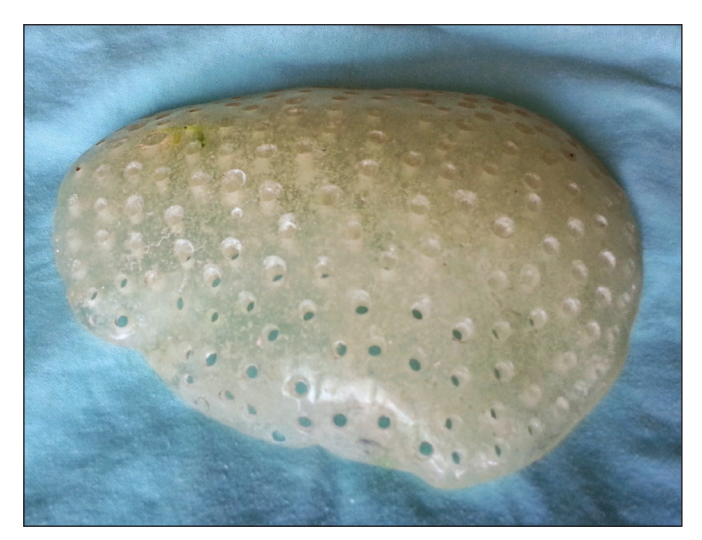
Figure 1: Customised PMMA cranioplasty implant.

In order to overcome the shortcomings of high cost and difficulty of intraoperative moulding, the authors used the bone flap of the patient harvested during the decompressive craniectomy as a template. This bone flap was used as a template to construct a C-silicone mould. This C-silicone mould was used to construct the bone flap for cranioplasty