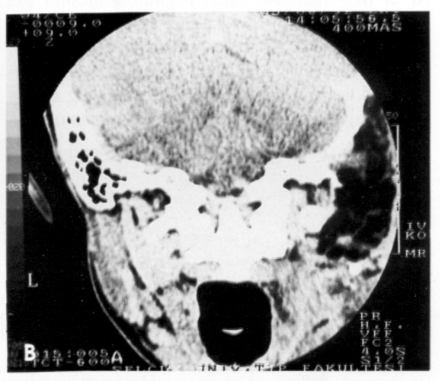
Fig. 2a,b: On postoperative axial and coronal CT, complete removel of the tumuor.

of the mass on CT was meningioma, it was thought that it could be a neurogenic tumour due to its configuration so from that standpoint, the infratemporal A approach developed by Fisch, was chosen for complete removal of the mass.