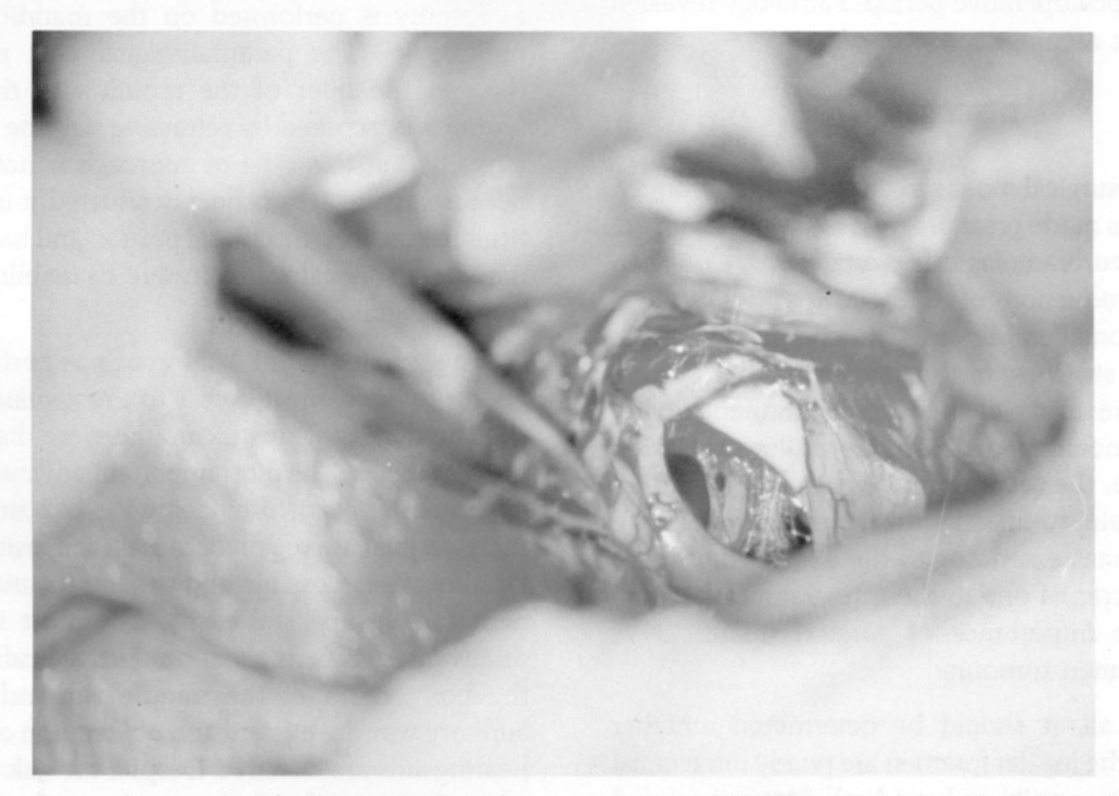
Fig. 5: The seventh and eight cranial nerves, brain stem, PICA and cerebellum at the tip of the bipolary forcep after total excision of the tumour.