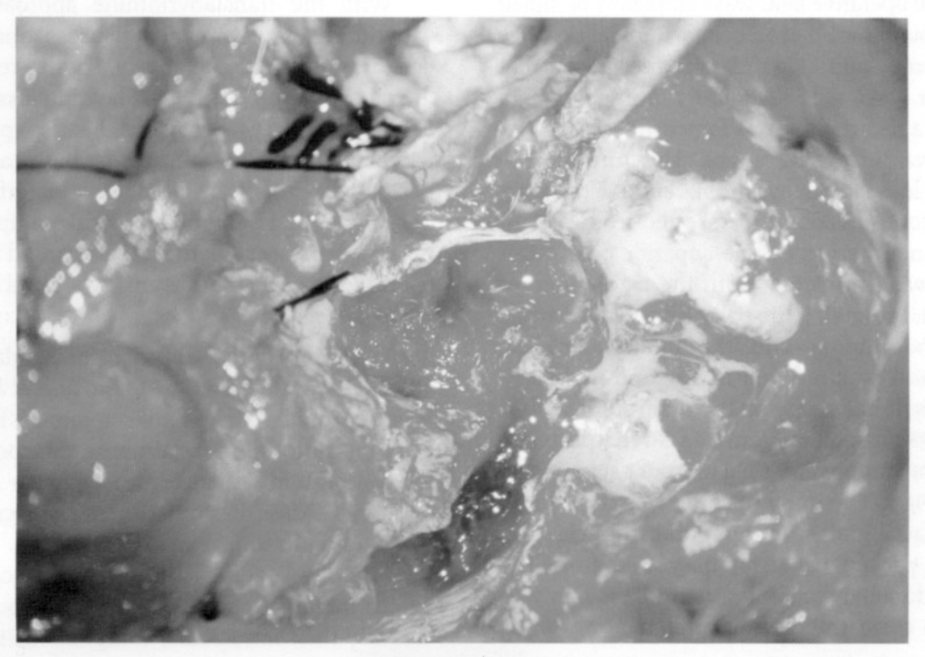
Fig. 4: Tumoral tissue at the tip of the aspiration tube and cerebellum immediately above are seen.