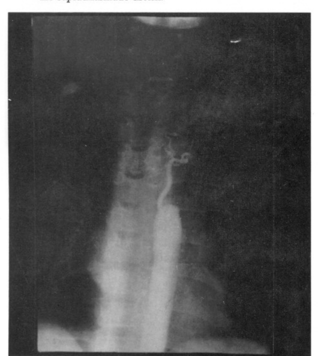
Fig. 3: Aortography by femoral route showing coarctation of the aorta.

sec and P.I: 0.79. At this moment the right side began to be affected by the vasospasm: at 60 mm depth Vm was 92 cm/sec and P.I: 0.88 (Fig 2E).