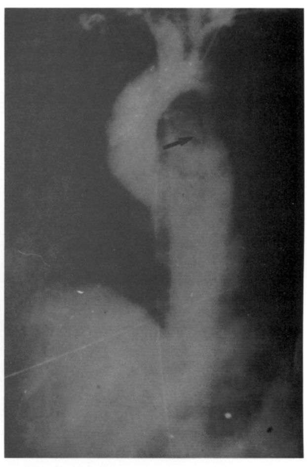
Fig. 4: a) Cerebral angiography showing the aneurysm. b) Proximal portion of the arcus aorta.

was observed (Fig 4) and the proximal portion of the arcus aorta was visualisied. The ultimate preoperative check of the cerebral arteries by TCD was within normal limits.