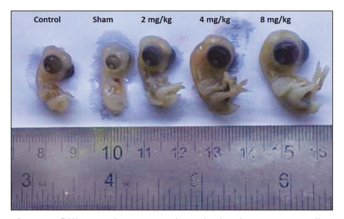
Figure 1: Difference between embryonic development according to the groups. Macrosomia is clearly seen in both medium and high dose pregabalin groups.

There was a statistically significant difference between the groups in terms of tubule damage (p=0.02; for tubule damage, see Table III). When subgroup statistical analysis was performed, there was no significant difference between the control group (Group I) and vehicle group (Group II) and low dose group (Group III; p=0.006 and p=0.007, respectively). However, the control group (Group I) was statistically different from the middle and high dose groups (Group IV and Group V; p=0.001).