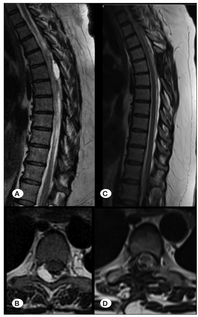
Figure 2: Case Sample 2: Preoperative sagittal (A) and axial (B) T2W MRI images of an arachnoidal cyst on thoracic level. 1st-year postoperative sagittal (C) and axial (D) T2W MR images revealed complete excision of the cyst.

plans. In these cases, fenestration does not work, so it is obligatory to open the cyst in all segments and perform the procedure. Although conservative management of patients with incidental or asymptomatic spinal arachnoid cysts can be effective, symptomatic spinal arachnoid cysts require surgical treatment. Cyst resection, cyst fenestration (10,24,28), and cystoperitoneal shunting are recommended procedures (2,3).