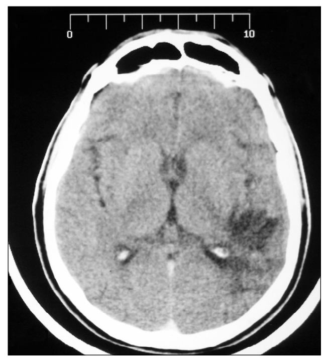
Figure 1: CT image demonstrating left occipito-parietal hypodense lesion compatible with left posterior cerebral artery infarction.

he presented with alteration in consciousness and right hemiparesis (3/5) on September 23. His radiological and laboratory investigation on admission were again normal. However, his control CT revealed a left occipito-parietal hypodense lesion compatible with left posterior cerebral artery infarction (Figure 1). The patient was hospitalized and given proper treatment. The diagnosis was ischemic stroke.