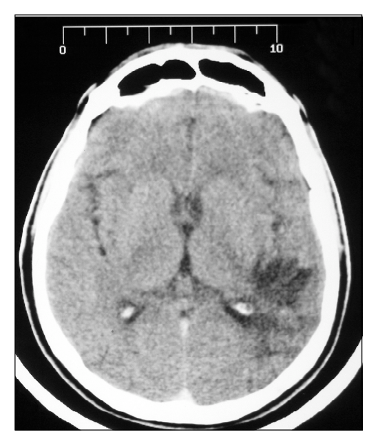
Figure 3: Patient's post discharge control tomography was free of the described lesion.

and supportive management. The control CT on the 2nd week of therapy showed a decrease in the size and enhancement of the lesion. Following intravenous antibiotic therapy for 6 weeks, He was discharged with mild deficits. His post-discharge control tomography was free of the described lesion (Figure 3).