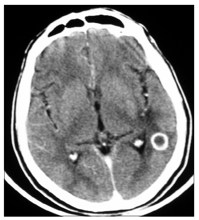
Figure 2: Patient's enhanced CT revealing a ring-like shaped lesion over the previous infarct

to the lateral margin of the infarct site that was shaped like a ring, showed hyperdensity and was nearly 1 cm in diameter (Figure 2). The lesion was not demonstrating any mass effect and there was no obvious edema around it. The radiological interpretation was not clear because of the doubt whether the lesion was a hematoma in the absorption phase or an abscess. Magnetic resonance imaging (MRI) could not be performed to rule out