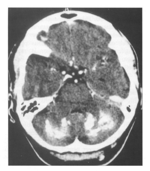
Figure 1b: Computerized tomography of case 1 patient shows bilateral cerebellar calcifications.

revealed diffuse calcifications bilaterally in the cerebellum, thalami, basal ganglia and white matter, that was consistent with the diagnosis of Fahr's disease (Figure 2).