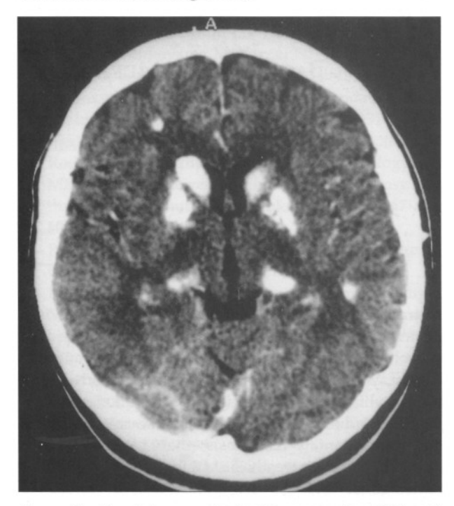
Figure 1a: Cranial computerized tomography of Case 1 with bilateral striopallidodentate calcinosis. This individual had post-parathyroidectomy hypocalcemia. Note the calcifications in the white matter, thalami and basal ganglia.

she had been operated for thyrotoxicosis due to Grave's disease. She has developed hypocalcemia as a results of the parathyroidectomy for eighteen years. The patient's blood biochemistry findings were normal except for hypocalcemia (Ca 7.6 mg/dL) and elevated serum phosphorus (P 7.1 mg/dL). Cranial CT revealed diffuse calcifications bilaterally in the cerebellum, thalami, basal ganglia and white matter (Figure 1).