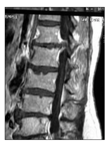
Figure 3: In contrast-enhanced MRI, there was no contrast enhancement in the extruded disk but the surroundings did enhance.

She underwent total laminectomy at the level of L1-L2 at the prone position. There was no significant extradural lesion after laminectomy. A hard mass could be felt along the dura. There was an intradurally positioned mass 1x1 cm in size consistent with an intervertebral disk. This mass pushed the rootlets posteriorly and caused significant traction. The thin arachnoid capsule over the disc mass was incised and the fragment was extirpated by microsurgical methods. There was a tear at the ventral wall of the dura. There was arachnoid membrane over the disc material and the rootlets were attached strictly to this membrane, especially at the right side. The disc material was highly calcified and contained bony particles. Dura was closed water-tight at the end of the operation. Pathological investigation of the specimen revealed degenerated cartilaginous tissue with mixoid degeneration and profuse edema. The patient had no complication and her pain resolved significantly. She was discharged 1 week after the operation.