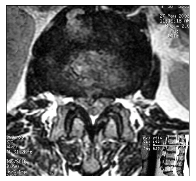
Figure 2: T2-weighted axial image shows the mass lesion at the level of the L1-L2 compressing the cauda equina.