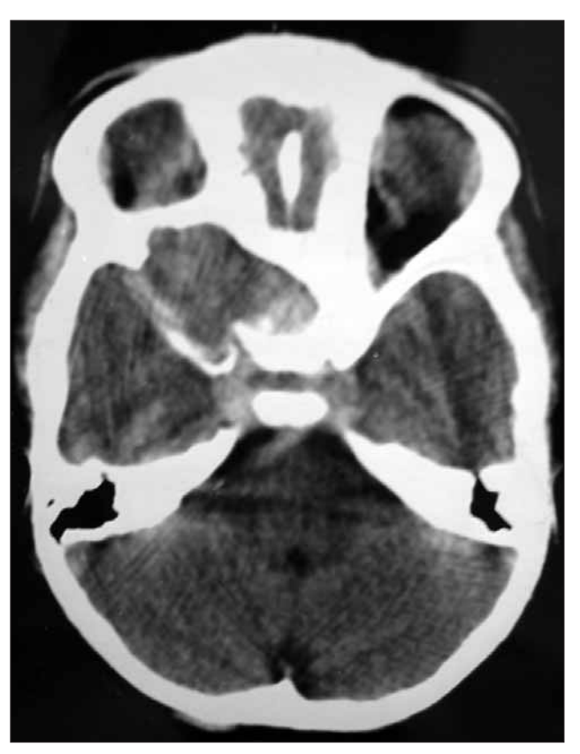
Figure 1: Computerized tomography (CT) of the head showing an expansile lytic lesion with thinned out cortex in the region of right lesser wing of sphenoid.

A right frontotemporal craniotomy was performed. There was cystic bony enlargement involving the orbital roof and greater wing of sphenoid with thin lining of cyst filled with turbid fluid and moderately vascular, friable greyish white tumor tissue. Gross total excision of the solid cystic lesion was performed. The diagnosis was confirmed