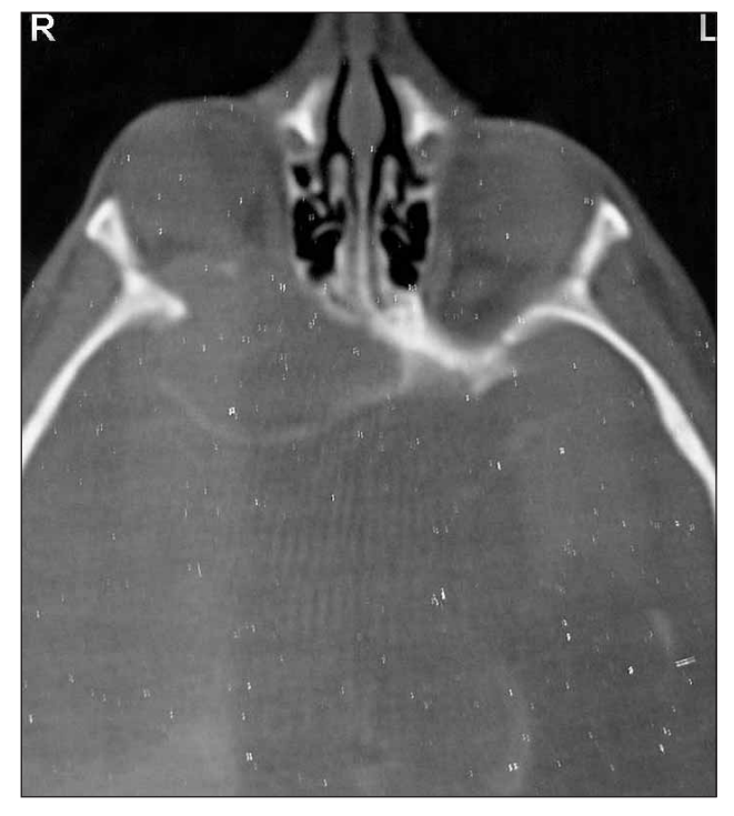
Figure 2: CT bone window showing an osteolytic lesion with bony enlargement and cortical thinning with no periosteal reaction.