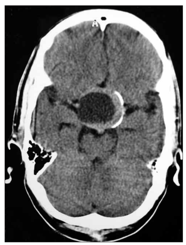
Figure 2: Axial noncontrast CT showing a hypodense suprasellar lesion with curvilinear calcification.