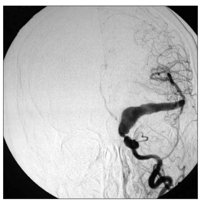
Figure 3: Cerebral angiography of the patient reveals a fusiform aneurysmatic dilatation and thrombosed aneurysm extending from supracavernous segment of the left internal carotid artery to the MCA M2 segment. Insular branches of the left MCA have normal calibration, but ACA shows weak filling beginning from the A1 segment.

Carotid bifurcation aneurysms are observed at a rate of 5% among intracranial aneurysms and present with symptoms caused by mass effect simply when they become large. Our patient experienced headaches and memory lapse; however, the development of bitemporal hemianopsia due to pressure on the optic tracts and chiasma as well as the development of hemiparesis, epilepsy, and homonym hemianopsia as a consequence of the extension of the GA towards MCA in the GAs located in the ICA bifurcation have been reported in the literature. Symptoms such as hypopituitarism, hemiathetosis, Parkinsonism, personality change, dementia, cortical irritation and epilepsy attacks can also rarely develop due to a mass effect (22,30).