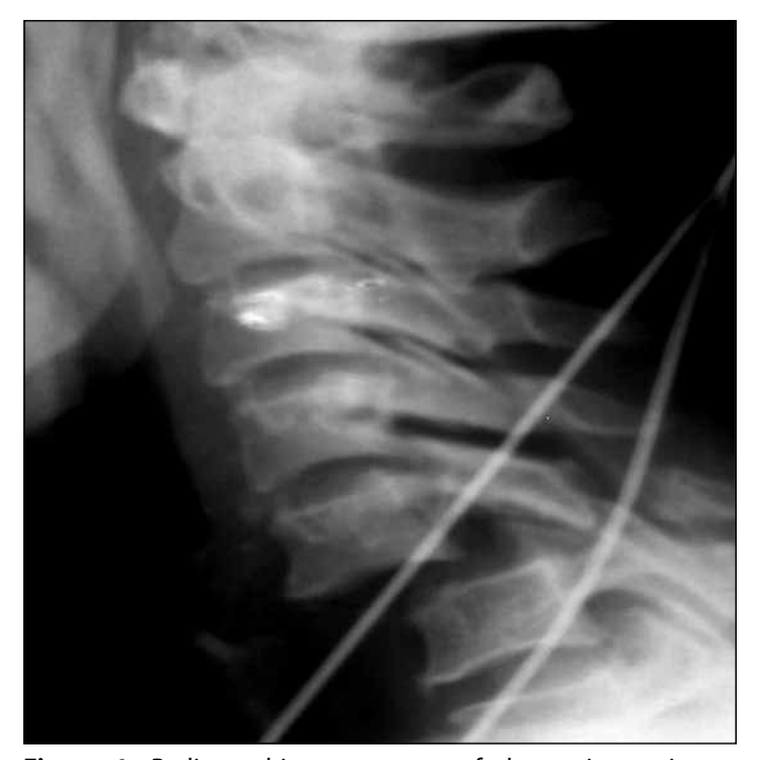
Figure 1: Radiographic appearance of the patient prior to surgery.

Cervical spine injury appears to have a specific association with BVI. High-speed motor vehicle crashes and falls account for the majority of cervical spine fractures and may account for the majority of VAI cases as well. Although BVI was initially thought to occur principally with upper cervical fractures, angiographic screening of cervical fractures has documented a significant coincidence of BVI with all types of spinal injuries such as 40% of lateral dislocations (16), 46% of midcervical