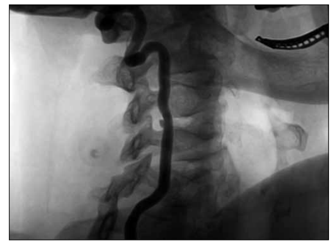
Figure 3: Digital subtraction angiography (DSA) of the patient showing a right vertebral artery pseudoaneurysm 3 mm in diameter originating from the level of the third cervical vertebra (arrowhead).