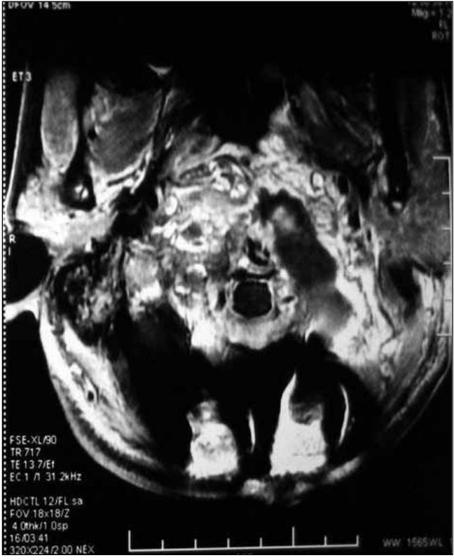
Figure 3: Postoperative MRI of the patient revealing decompression of the cyst on the left nasopharyngeal region with increased growth in right petrous region.

Aneurysmal bone cysts are relatively uncommon, welldifferentiated expansile benign tumors that present commonly in the first and second decade and are more common in females (19,9). Most of them are located in the metaphyses of long bones, and the knee joint is commonly affected where it affects tibia upper end. Other sites of involvement are flat bones and the vertebral column, 25% involve the vertebral body, hyoid, mandible and odontoid (5, 10). Aneurysmal bone cysts are common in the lumbar and thoracic spine. Involvement of the cervical region is a rare entity seen at a rate of 2%. Cases of cysts involving the C1 alone have been reported (7, 12, 15, 14). Cases with involvement of clivus and skull base without involving C1 were also reported (1, 17). Our case is unusual as the patient is a 45-year-old female and there is involvement of the posterior and anterior arch of the C1 C2 vertebral body and clivus, which has not been reported previously. It starts to involve