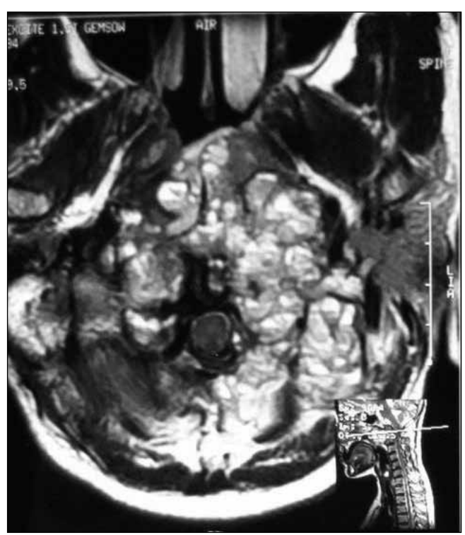
Figure 2: MRI of the patient showing typical fluid-fluid appearance of aneurysmal bone cyst involving clivus, C1 and C2.

Though post operative MRI (Figure 3) showed sufficient decompression, the tumor size had increased on the right side. Adequate stabilization was apparent on postoperative CT scan and X rays of the patient (Figure 4). She was considered for adjuvant radiotherapy and referred to the radiotherapy department. During follow-up for 1 year, she had no new complaints or neurological deficit.