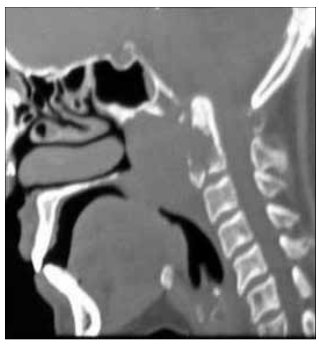
Figure 1: CT scan of the patient showing destruction of clivus, C1 and C2 vertebral body.

Histopathology revealed multiple cystic lesions separated by fibrous septae having spindle-shaped cells with multiple multinucleated giant cells (Figure 5).