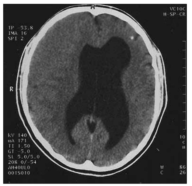
Figure 3: Postoperative CT scan that demonstrates right frontoparietal chronic SDH after the endoscopic third ventriculostomy.