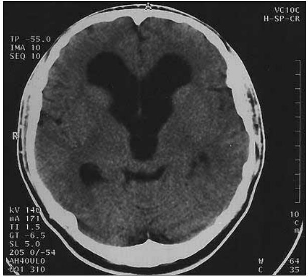
Figure 1: CT scan that demonstrates obstructive hydrocephalus and dilation of lateral ventricles and third ventricles.

ETV is a more suitable technique than shunt surgery for neurosurgeons since ETV decreases the incidence of