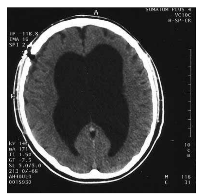
Figure 4: Postoperative CT performed after ETV showed the drained and smaller ventricles with no subdural collection.

problems such as infection, foreign-body reaction and lowpressure symptoms and shortens the duration of surgery (5,8). ETV interventions result in a high degree of success as well as a low complication rate, especially in subjects with obstructive hydrocephalus (8). The surgical morbidity and mortality rates of ETV were reported respectively as 0-20% and 0-1% in previously published serial studies (12). Many complications appear during the orientation of the endoscopic instrument. These are hypothalamic and thalamic injuries, injuries of he oculomotor nerve, basilar artery perforation, and intraventricular injuries. In addition,