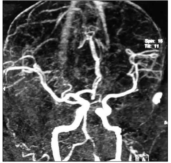
Figure 2: MR angiogram showing an aneurysm arising from the middle meningeal artery.