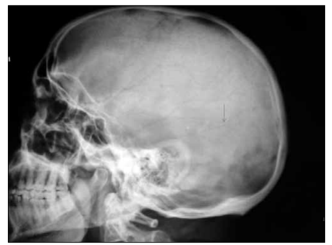
Figure 3: Skull X-ray revealing a fracture line going across the temporal bone.