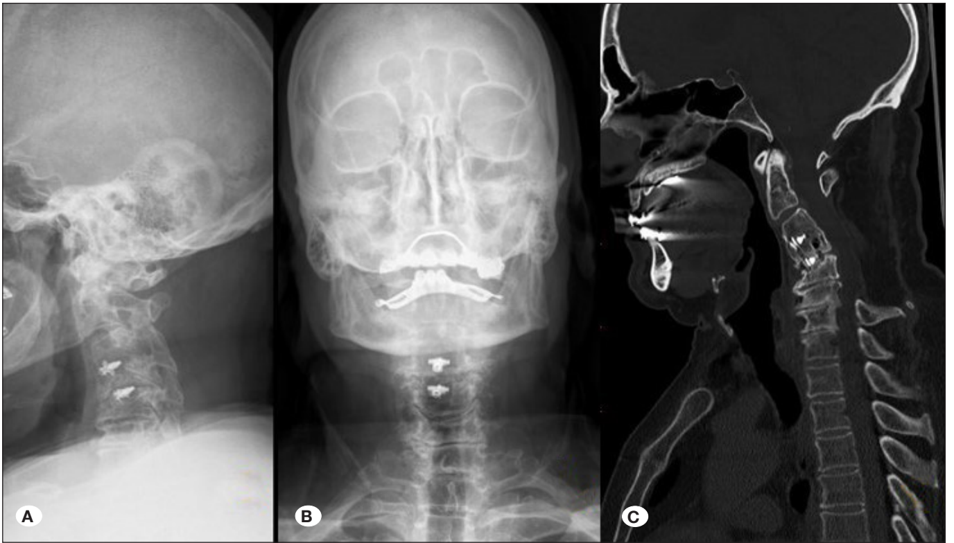
Figure 1: A 61-year-old male patient underwent 4 levels of extensive total laminectomy due to CSM through C3-4 and C4-5 anterior cervical discectomy + fusion + posterior intervention and severe neck pain started in the patient after 2 months. Postlaminectomy kyphosis is seen on the preoperative direct radiograph (A, B) and (C) computerised tomography (CT) sagittal image, before the patient's corrective surgery.