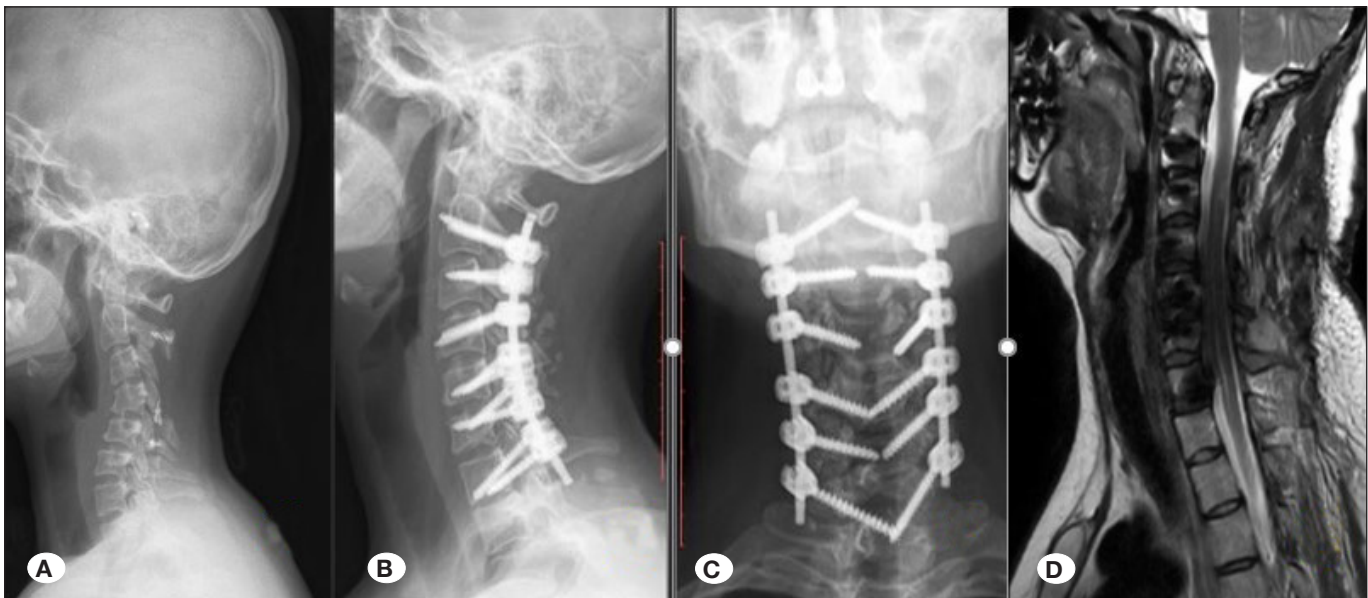
Figure 4: Preoperative radiograph (A), postoperative radiographs (B, C) and magnetic resonance imaging (D) demonstrating that kyphosis has completely resolved after pedicle fixation between C2-7 and two levels of ponte osteotomy (C4-5 and C5-6) are performed.

respectively. Postoperative NDI scores were significantly lower than the preoperative scores, with 15.24 \pm 4.24 and 29.76 \pm 4.85 , respectively ( p < 0.001 ). The postoperative VAS scores were significantly lower than the preoperative scores, with median (min-max) scores of 3 (2-6) and 8 (7-9), respectively.