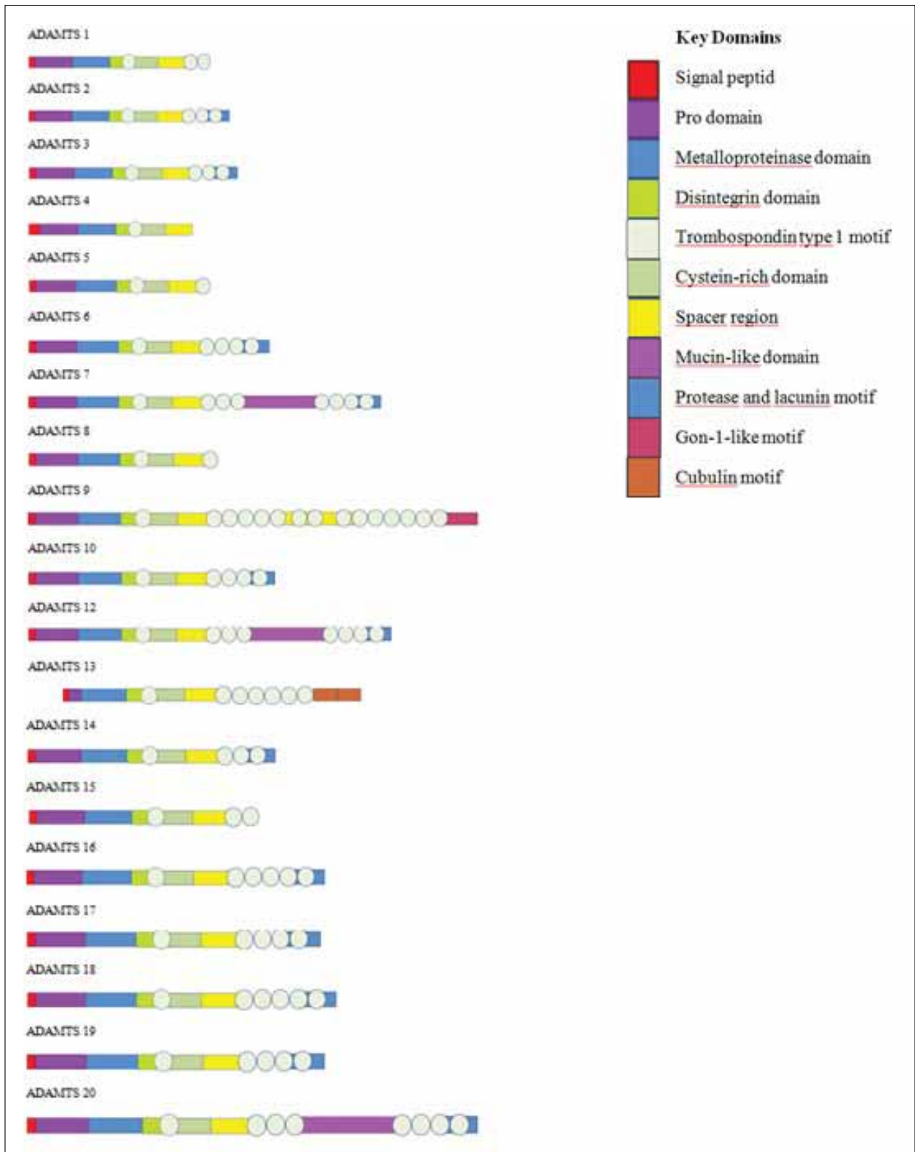
Figure 2: Domain structure of ADAMTS proteins (Key to domains).