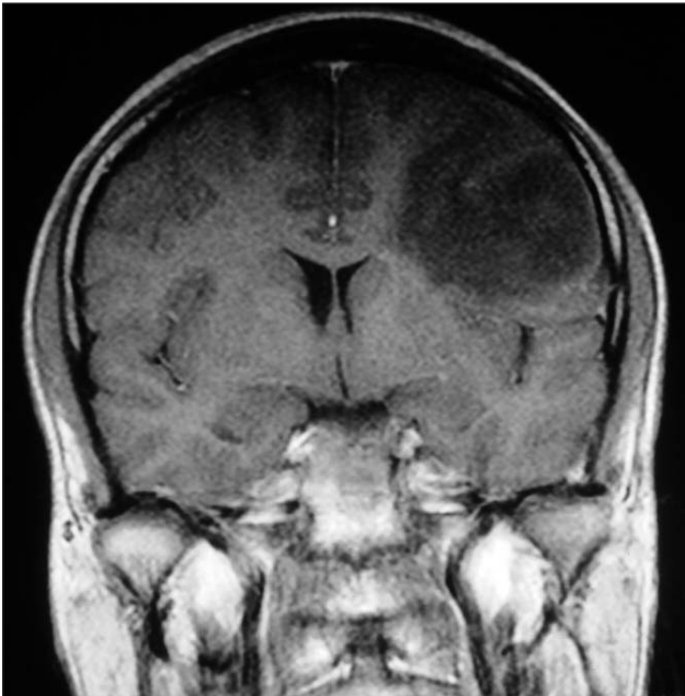
Figure 2: T1W MRI of sample case with no contrast enhancement and minimal mass effect.

choline and low NAA values glioma and cerebritis; and for cases with normal or low choline and low NAA values infarct and gliosis were possible diagnoses.