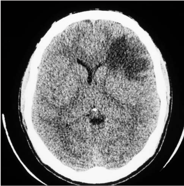
Figure 1: CT of sample case with hypodense lesion.